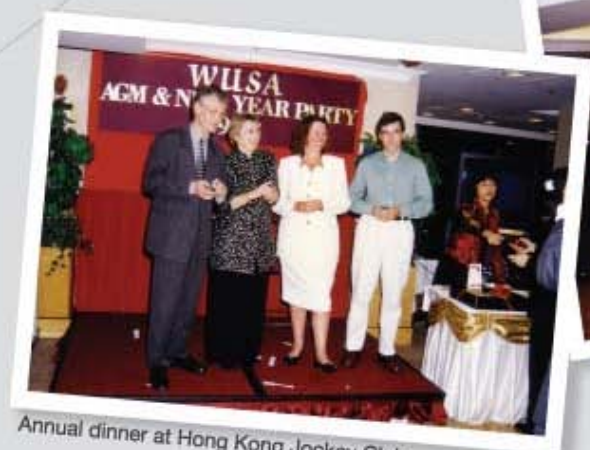
Annual dinner at Hong Kong Jockey Club