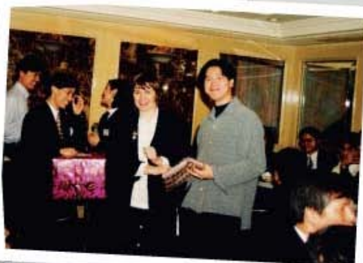
First annual dinner at Tack Hsin Restaurant