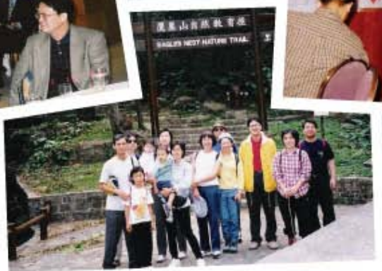
Hiking at Eagle's Nest Nature Trail