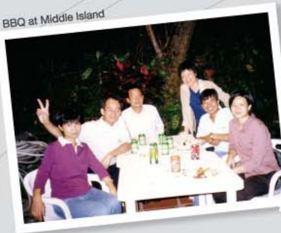
BBQ at Middle Island