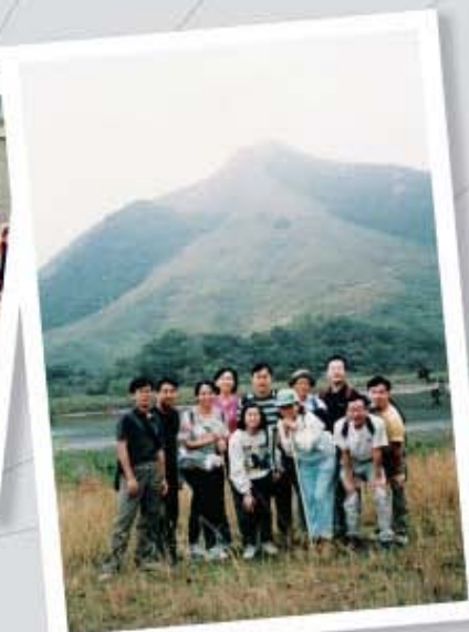
Hiking in Sai Kung