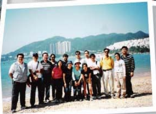
Hiking from Tai Tam Bay to To Tei Wan