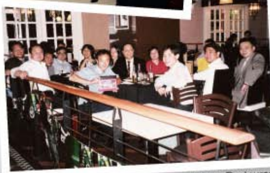
First monthly happy hour gathering at Bravo Restaurant