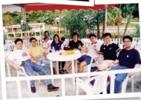
BBQ at Tai Mei Tuk