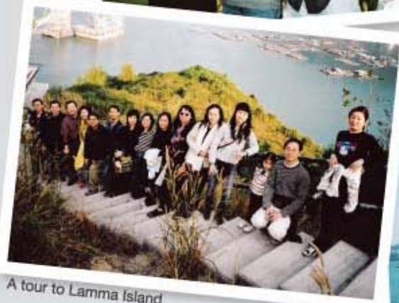
A tour to Lamma Island