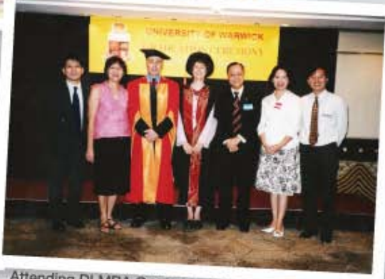
Attending DLMBA Graduation Ceremony