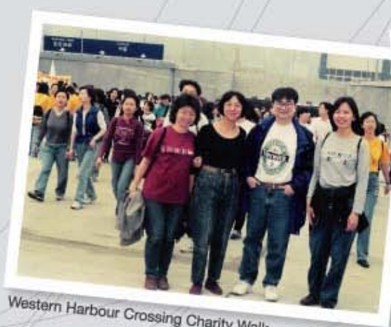
Western Harbour Crossing Charity Walk