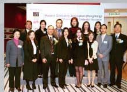
Executive Committee 2004-05