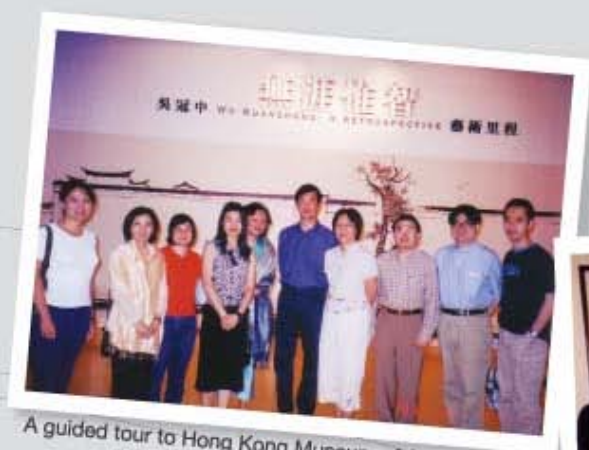
A guided tour to Hong Kong Museum of Arts