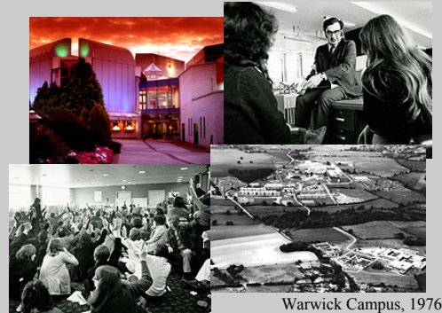
Students’ Union meeting - early 1970s