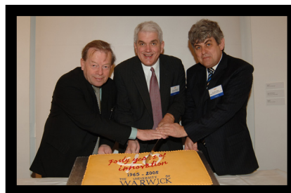
VIP Reception in the Arts Centre