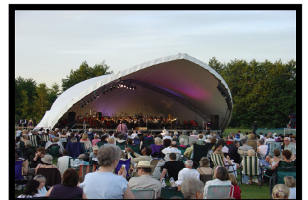
Free Open Air Gala Concert