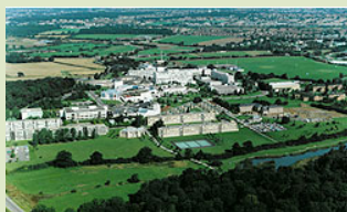
Warwick Campus, 1987