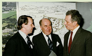
Opening of the Science Park